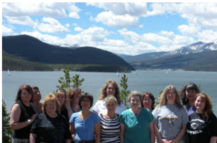
Group Picture except for a few people that had already left.