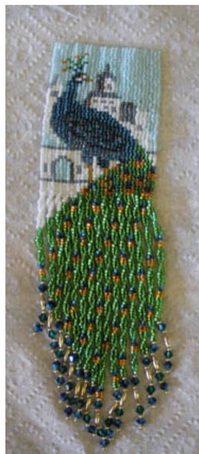
Dawn;s Peacock! Beautiful!

More Pictures on the website and a zip file too!